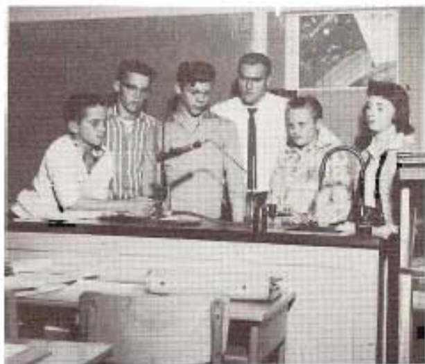
Watch it! That test tube is hot.

Caught amid simulated atom structures and laboratory experiments, the students exhibit a stepped up interest in our stepped up science program.