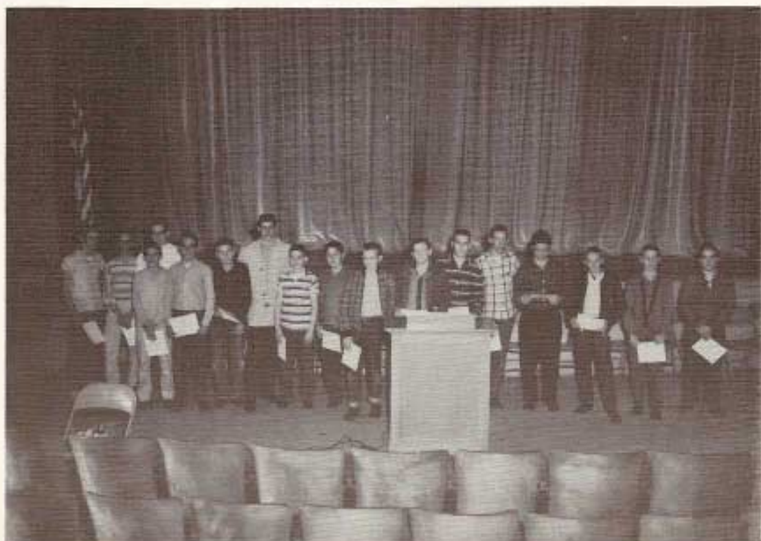
Below, these boys have received their "D" Certificates indicative of perseverance and determination on the football squad.