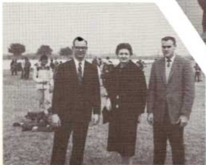
Scenes taken from various phases of school life— Science experiments, assembly programs, literature projects, playground activities.