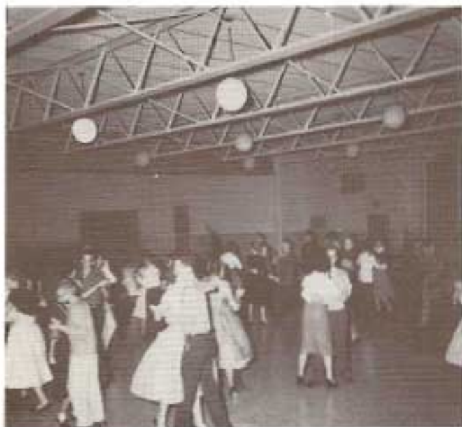
And the band played on!