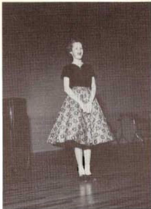
Maybelle really sings out on "Wincer Wonderland."

Little Black Sambo refused to give Goldilocks and Snow White the Christmas tree in a skit entitled "The Christmas Tree."