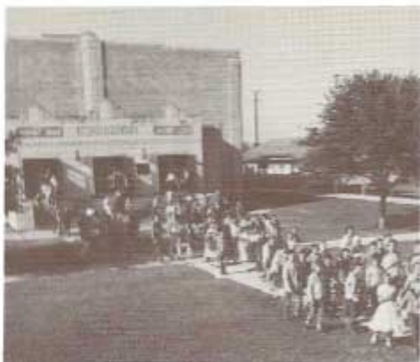
Are these students really eager to get back to class?