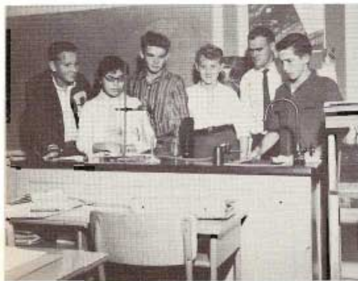
Of course, every experiment isn't successful, but it's sure fun trying.