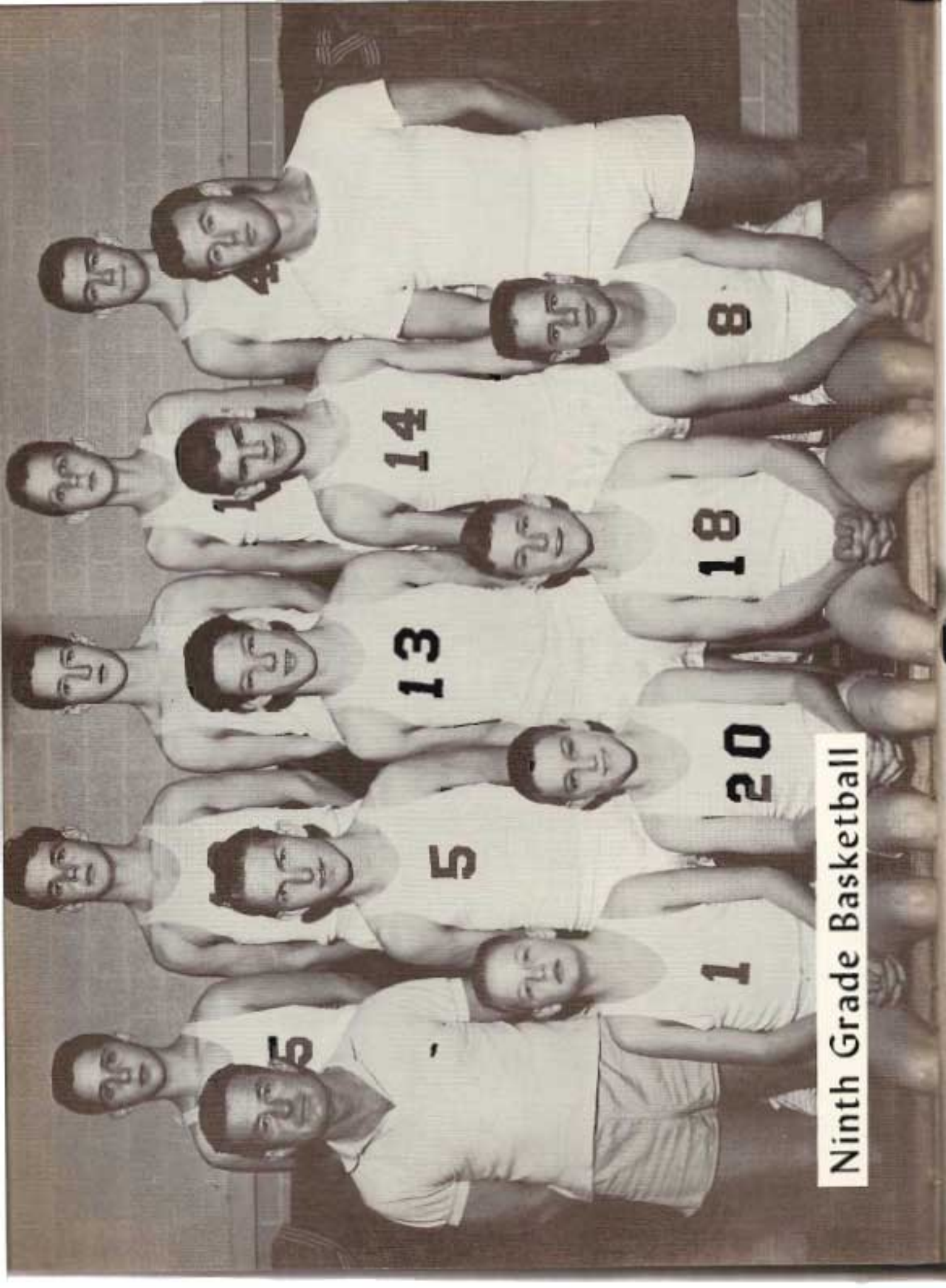
Ninth Grade Basketball