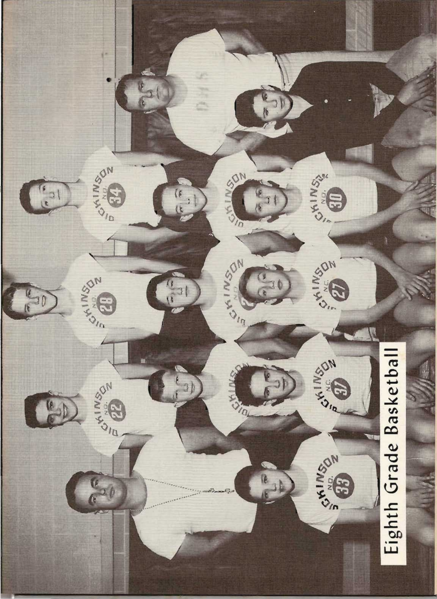
Eighth Grade Basketball