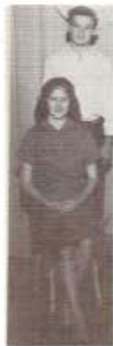
Don't they make a lovely couple?