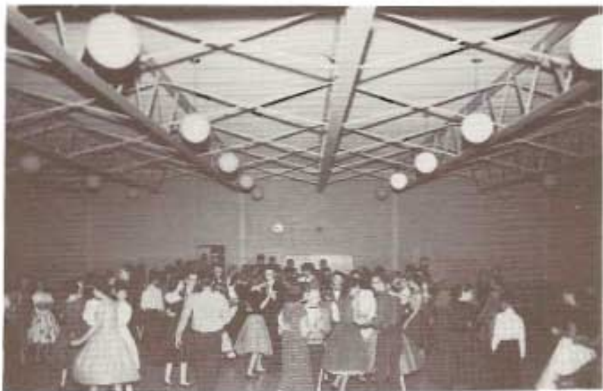
The clock says we're just getting started.