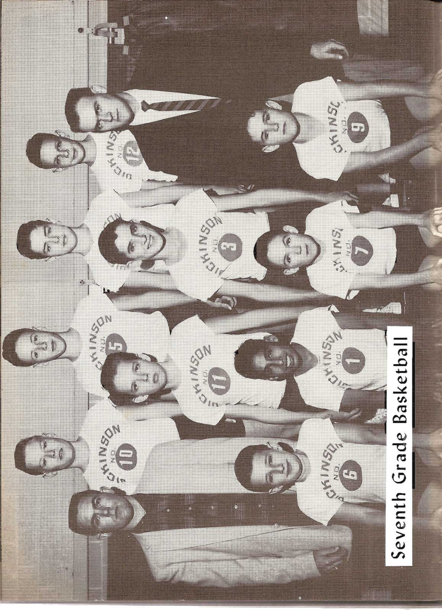
Seventh Grade Basketball