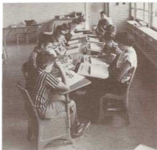
It's really fun to read stories aloud.