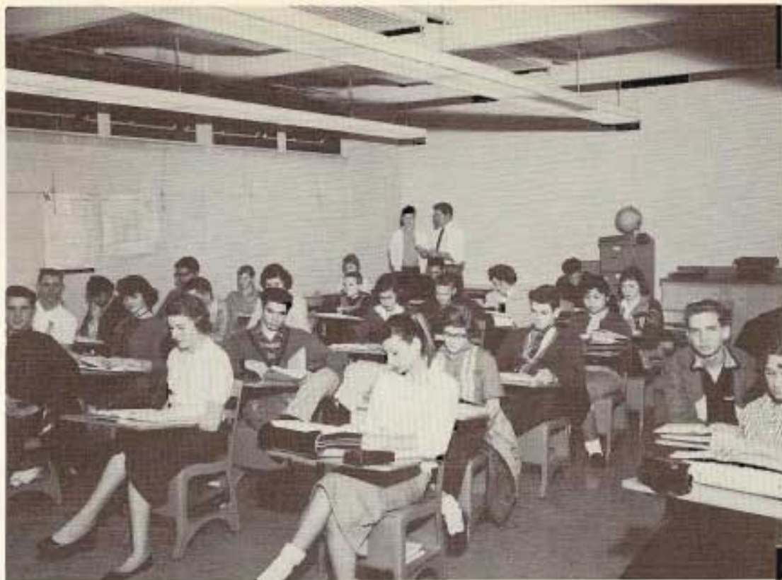
This class of ninth graders finds time for some English review.