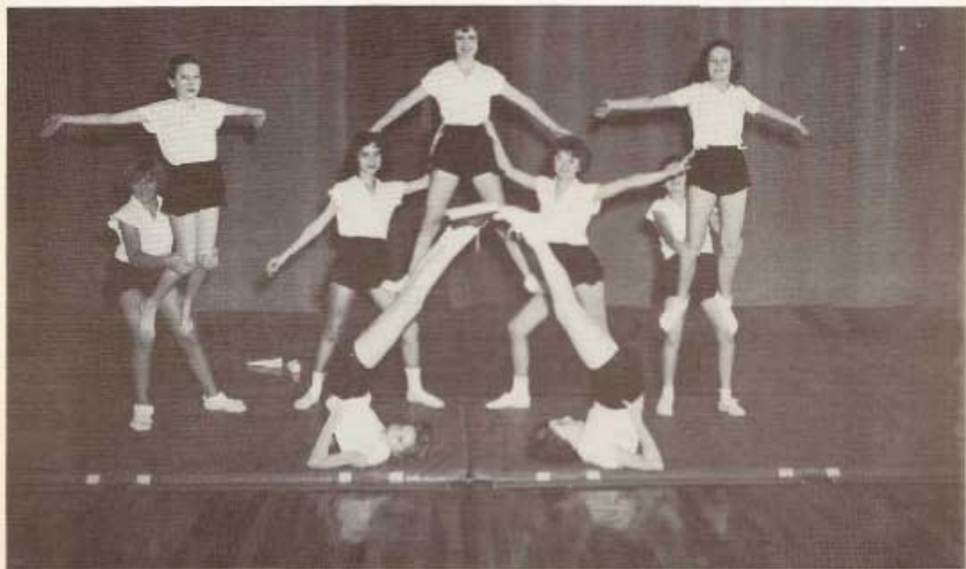
The girls below illustrate the archway, the pyramid and thigh-balance.