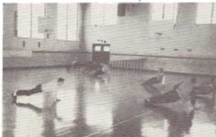
Senior Football Team Members Leading a Yel