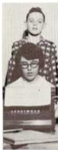
Snooping again, Eddie? Or does Dana's typing fascinate you?