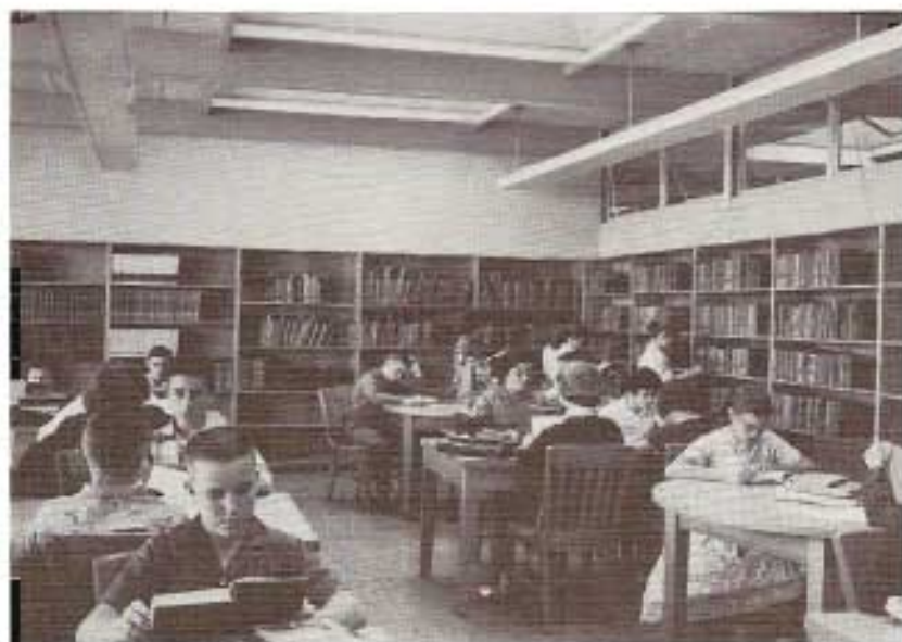
The Library is a place for study and that's what these students are doing.