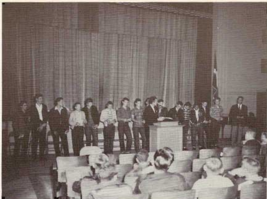
These proud-looking boys have just been presented with their "D" Awards for outstanding participation and Athletic ability in football.