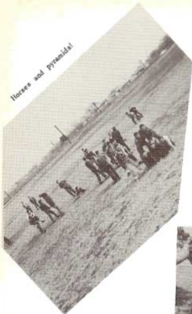
Horses and Pyramids!