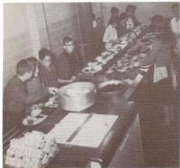
This is where you don't mind taking it when it's dished out to you.