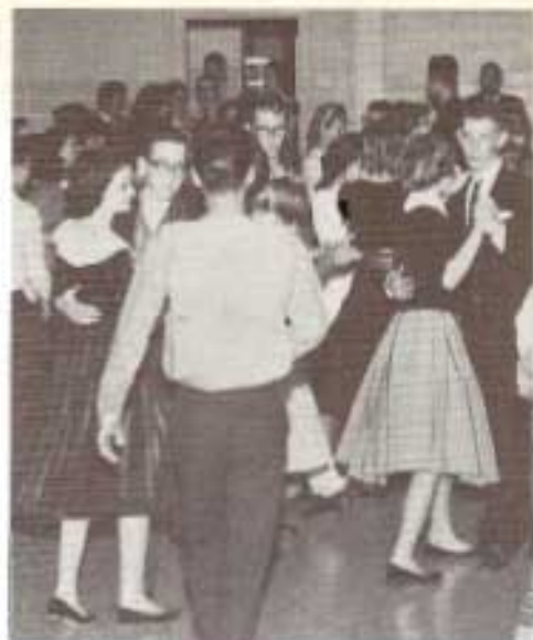
There is always at least one wall flower.