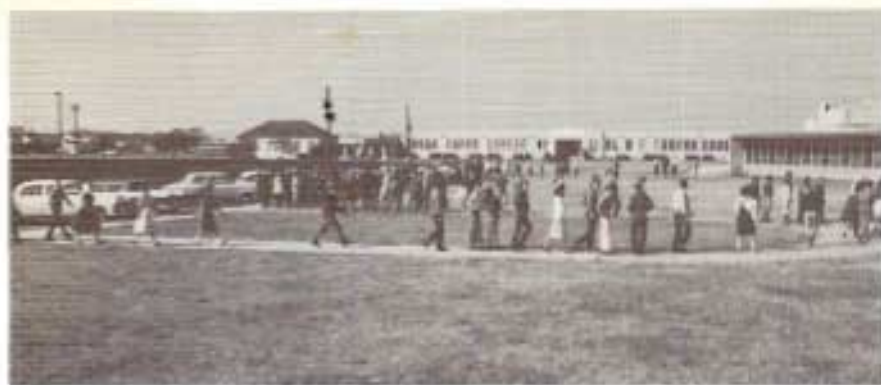
Fire drill's over - the building didn't burn.