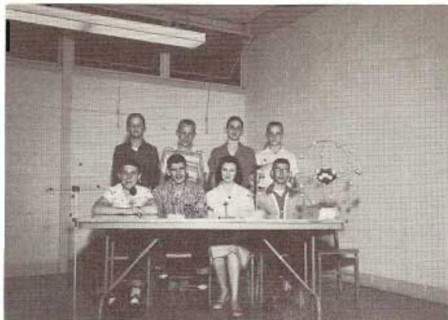
These are atoms?

Caught amid simulated atom structures and laboratory experiments, the students exhibit a stepped up interest in our stepped up science program.