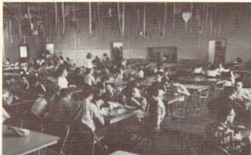
What other school do you know that has a decorated cafeteria?