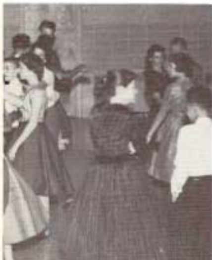
And then there are those that just stand and talk.