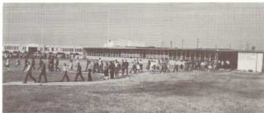
What! Another fire drill!