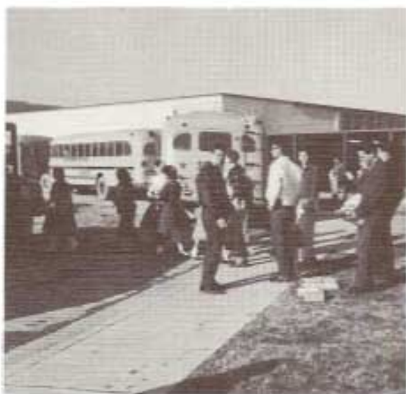
Eddie, don't just stand there, catch the bus.