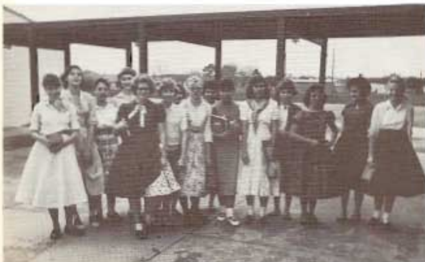
The latest styles in Junior High fashions.