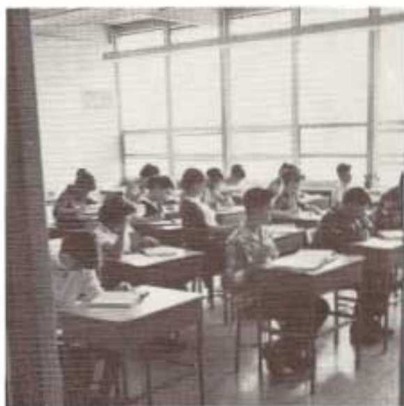
Even amid scenes of pleasure, there are those students who seek diligently for knowledge. We salute you.