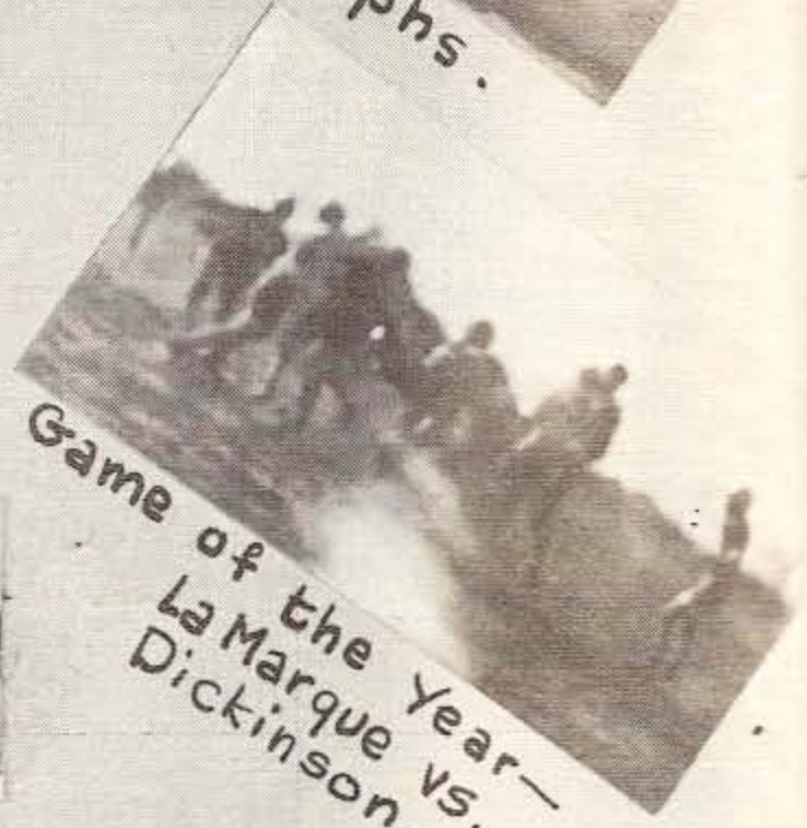
Game of the Year— La Marque vs. Dickinson.