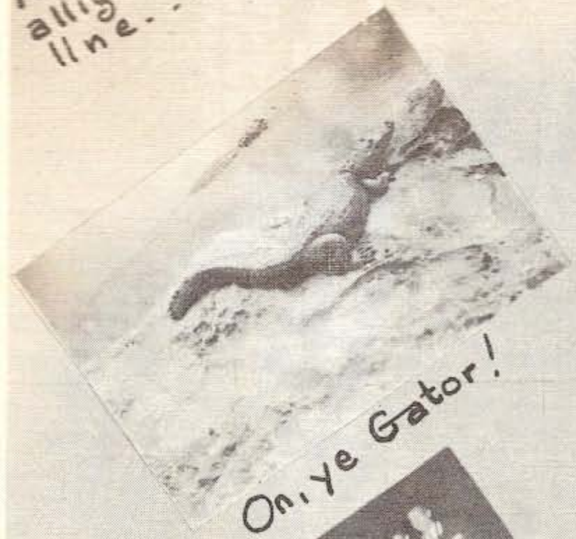
On, ye Gator!

..... We're gonna win this game another time