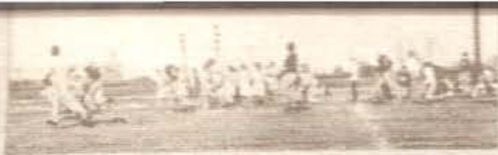
Where's the fire?