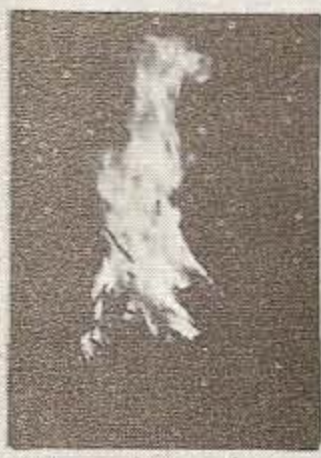
The heat's on!