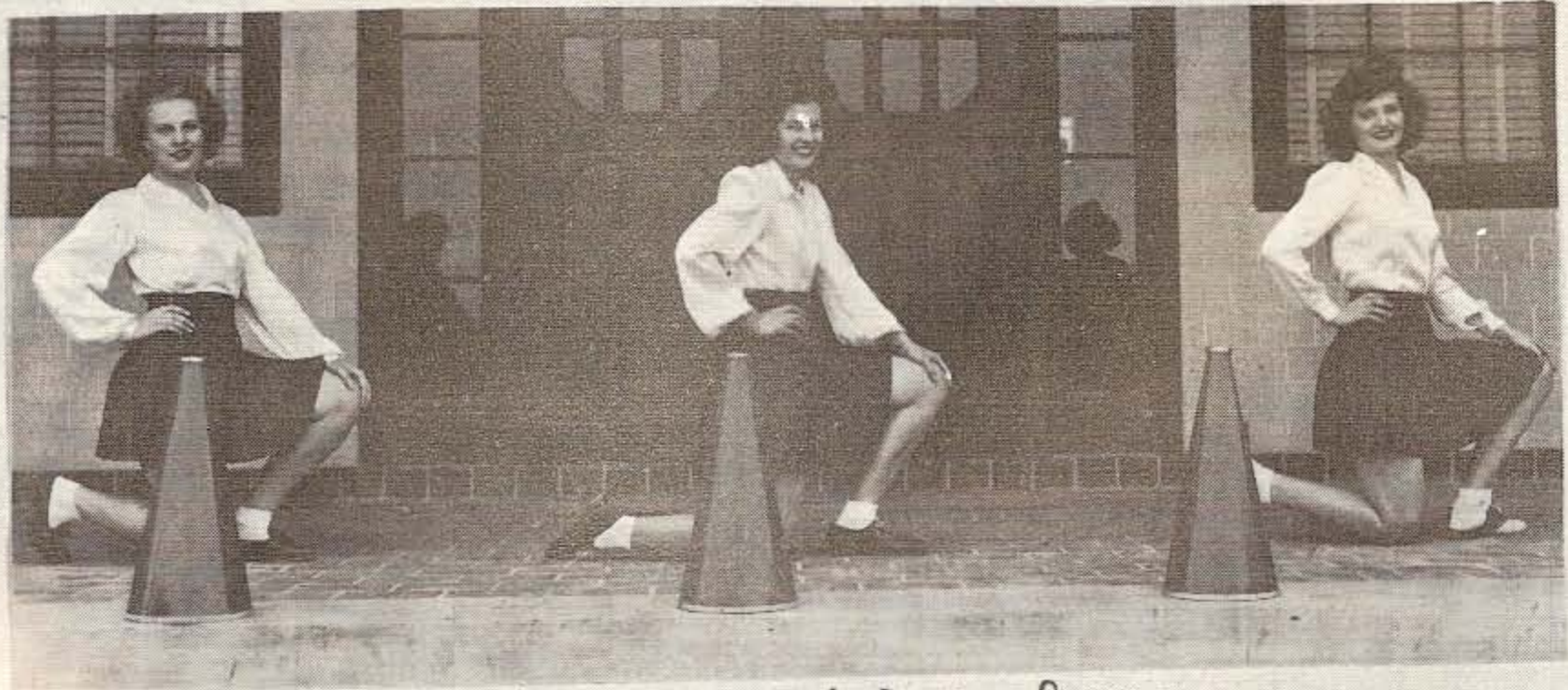
Loud, cute, and full of pep.