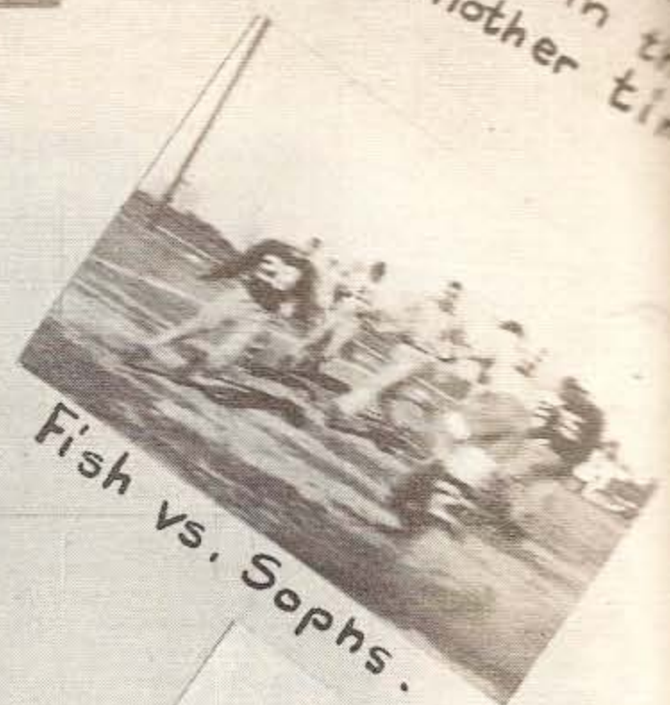
Fish vs. Sophs.